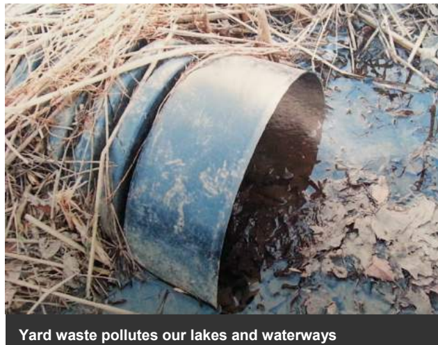
Yard waste pollutes our lakes and waterways